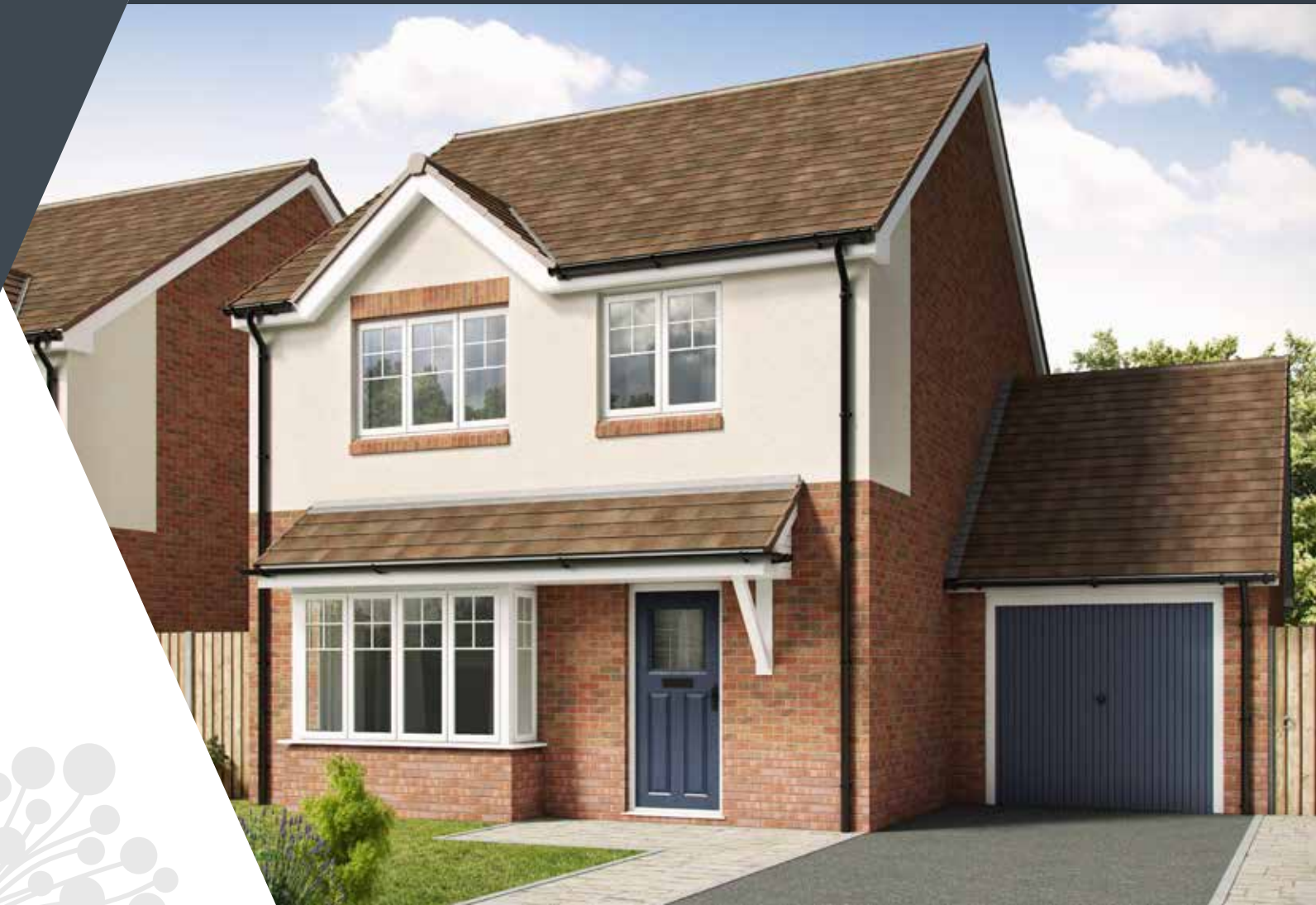
The Meole 3 bedroom home