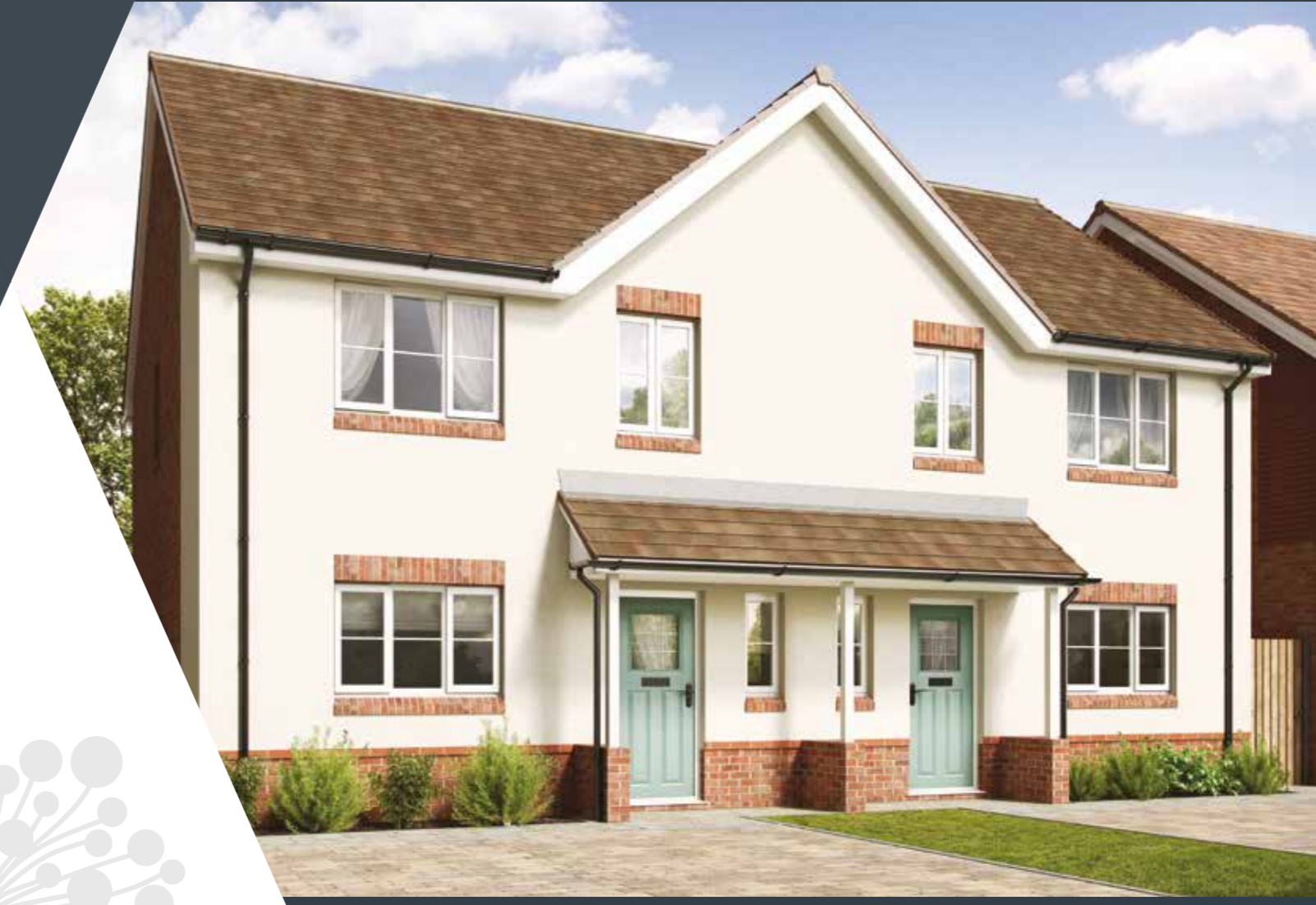
The Claremont 3 bedroom home